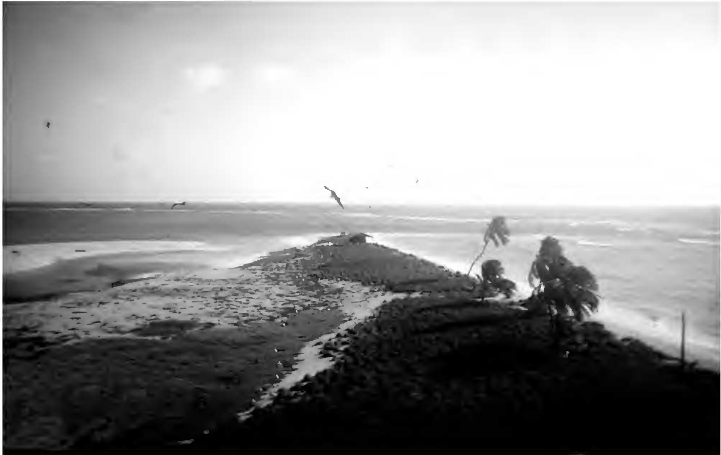
Fig.2- View of Farol Island from the Lighthouse.